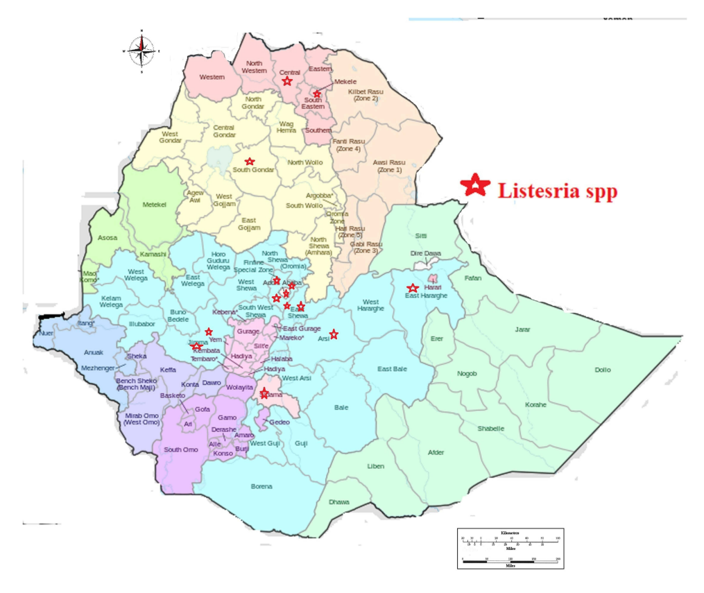
Figure I Map of Listeria spp reported area.