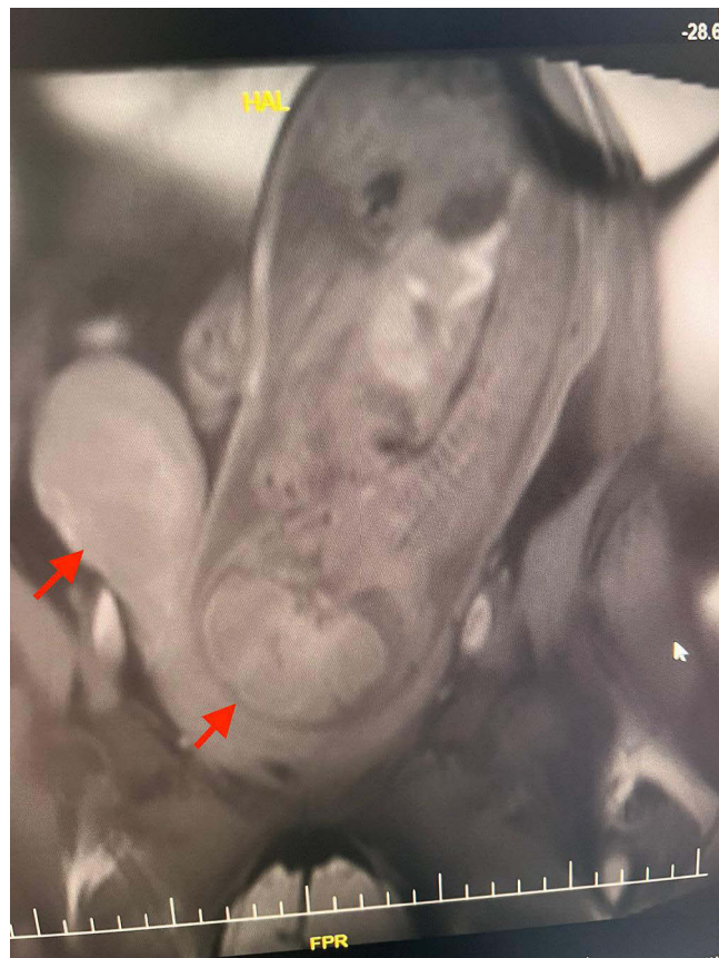
Figure 2 Magnetic resonance image showing two adjacent noncommunicating uteri (arrows), one of which is empty and the other is bearing a fetus.