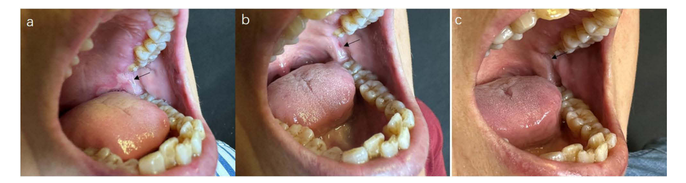
Figure I Mucous membrane pemphigoid with the oral predominant response to abrocitinib therapy. (a) before the abrocitinib therapy. (b) Two weeks later after the abrocitinib therapy. (c) Four weeks later after the abrocitinib therapy.