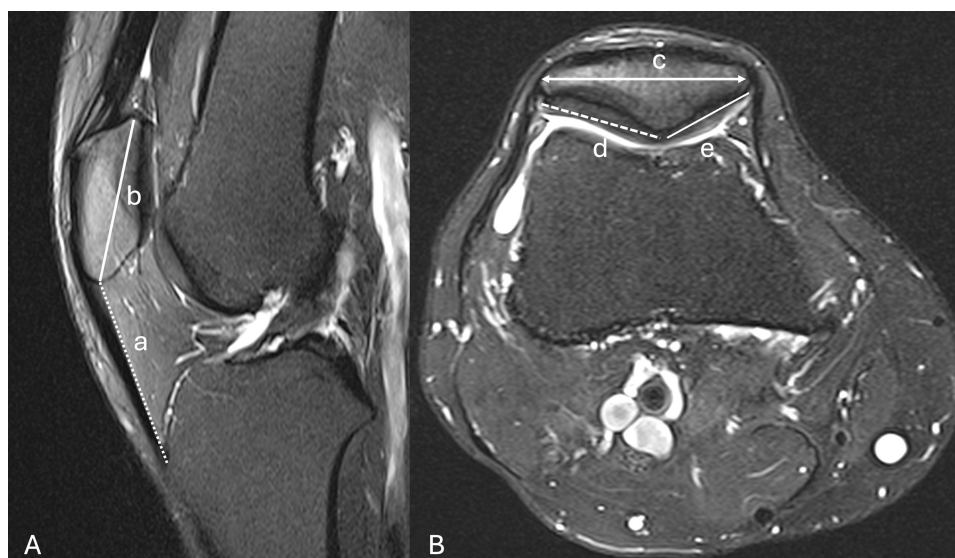
Figure 1 Patellar morphologic parameters. a: patellar ligament length, b: patellar height, c: patellar transverse diameter, d: lateral patellar facet, and e: medial patellar facet. (A) Midsagittal T2-weighted image. (B) Axial T2-weighted image.