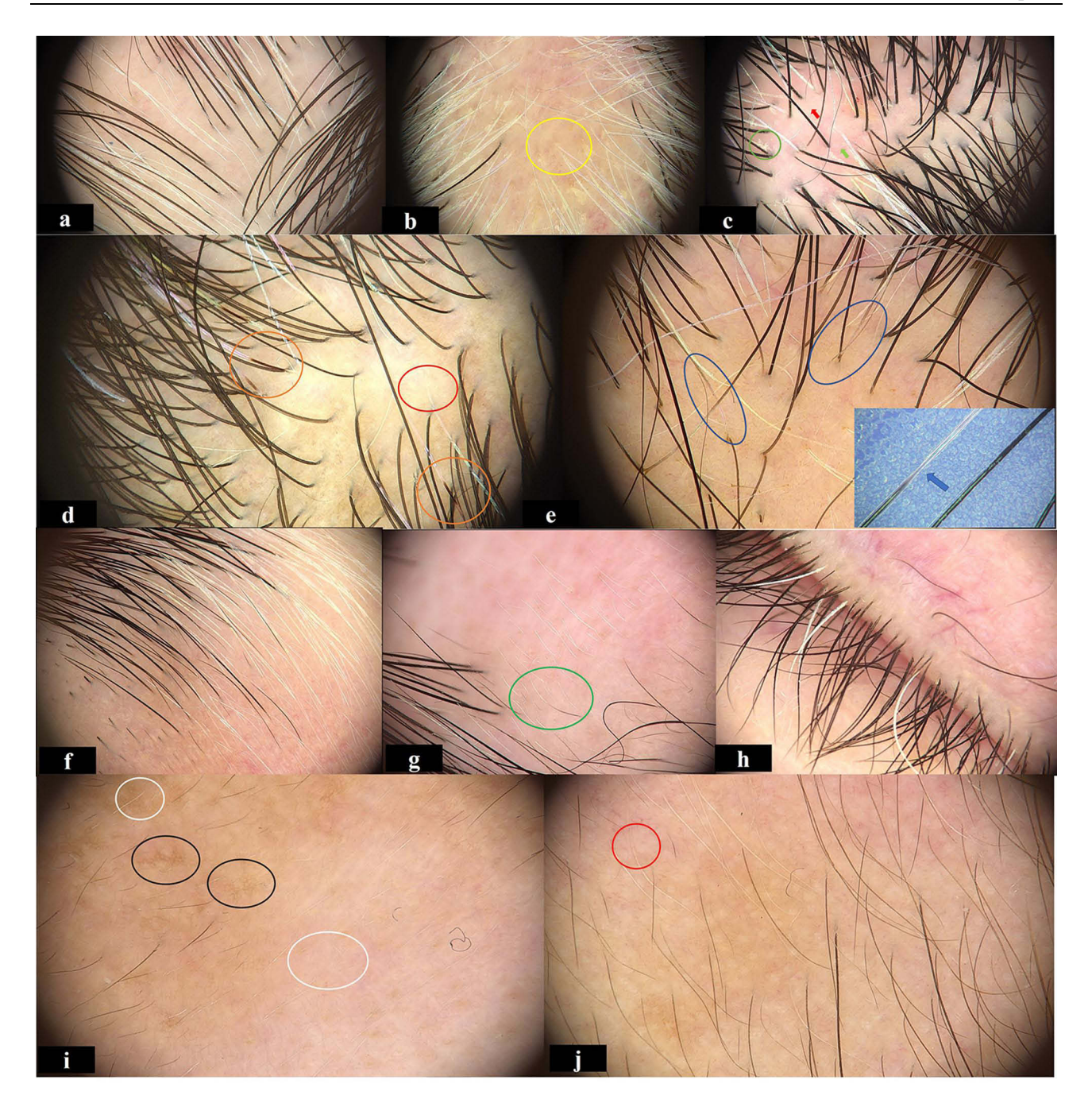
Figure I Representative dermoscopic signs of VAL (20×, 50×): (a) diameter diversity of leukotrichia, (b) clustered leukotrichia (yellow circle) with telangiectasia and scales, (c) red-white area (green and red arrows) with scales, (d) repigmented leukotrichia (Orange circles) and perifollicular depigmentation (red circle), (e) depigmented hair roots (blue circle) and Pohl-Pinkus constrictions of hair shaft under contrastive blue background (blue arrow). (f) Dermoscopic signs of eyebrow, (g) repigmented leukotrichia (green circle). (h) Dermoscopic signs of eyelashes: scattered white eyelashes with invisible perifollicular changes. Dermoscopic signs of vellus hair in (I and j): (i) Honeycomb-type hyperpigmentation (black circles) and residual perifollicular pigmentation (white circles), (j) perifollicular depigmentation (red circle) and telangiectasia.

The prevalence of residual perifollicular pigmentation, white areas, red areas, and telangiectasia signs was similar between progressive and stable stages (P>0.05).