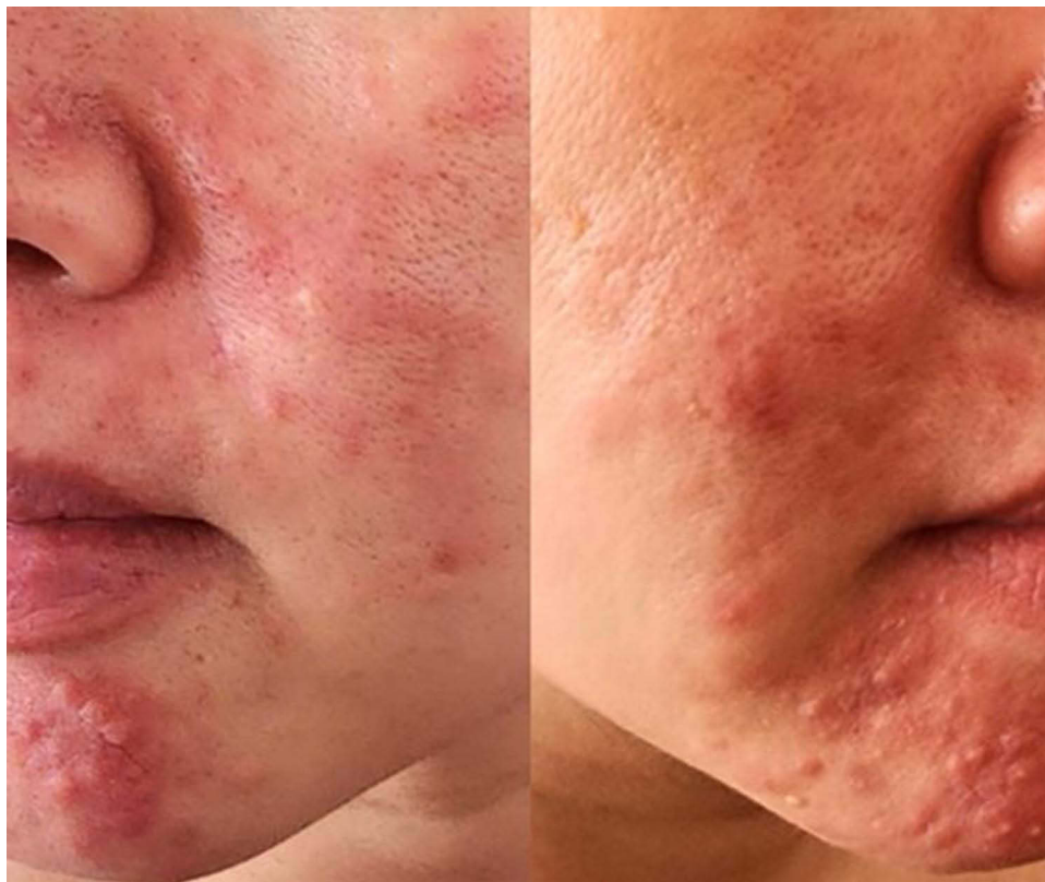
Figure 4 Multiple inflammatory papules, nodules, pustules, and whiteheads around the mouth accompany redness and swelling on the face. (Case 3).

A standardized skin surface biopsy from her cheek showed 63 mites/cm 2 , while superficial needle-scrappings from five pustules found 2 Demodex mites and numerous bacteria. The patient was diagnosed with moderate to severe acne and demodicosis. The acne was treated with a combination of oral doxycycline (200 mg/day) and intralesional steroid injection (2.5mg/mL), while demodicosis was effectively treated with oral ivermectin (200 µg/kg/week) and topical