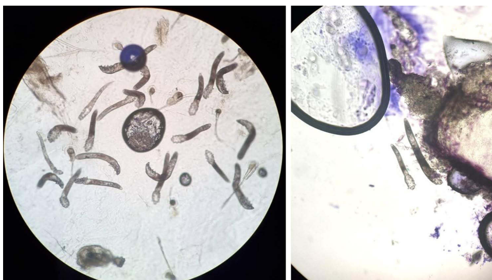
Figure 2 Standard skin surface biopsy revealed multiple Demodex mites on the right cheek, and superficial needle-scrappings confirmed their presence in the pustule. (Case 1).

itching and irritation on her face as well. Upon the physical examination, it was observed that the patient had multiple inflammatory papules and pustules on her face, especially on the chin area, with whiteheads and blackheads. Additionally, there were erythematous, dry patches with follicular scales on both cheeks (Figure 3). A standardized skin surface biopsy from her cheek showed 84 mites/cm 2 . Superficial needle-scrappings from five pustules found 4 mites with numerous bacteria. The patient was diagnosed with demodicosis and acne. Additional treatment consisted of oral ivermectin (200 µg/kg/week), topical permethrin cream 5%, and oral doxycycline for three months.