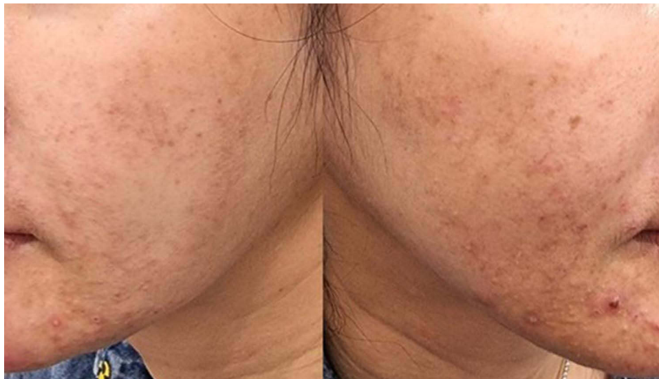
Figure 3 Red, dry patches with scaly follicles on both cheeks accompanied by multiple whiteheads, blackheads, and inflamed papules on the chin area. (Case 2).