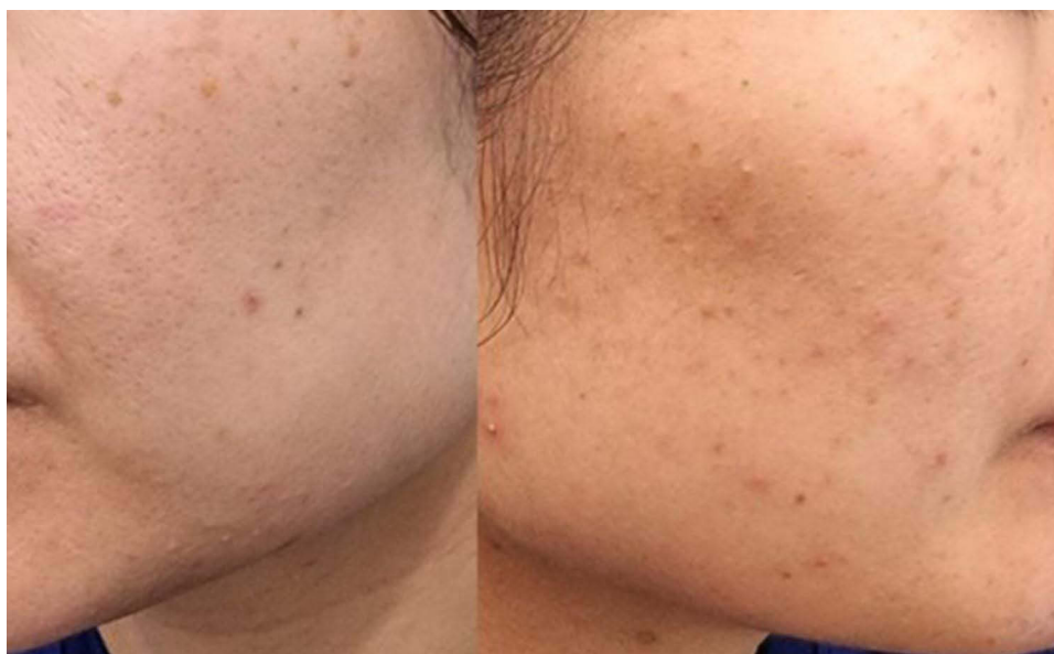
Figure 1 Multiple whiteheads, blackheads, erythematous papules, and pustules, mainly on the right cheek, chin, and mandibular area, with some areas of redness, dryness, and roughness. (Case 1).