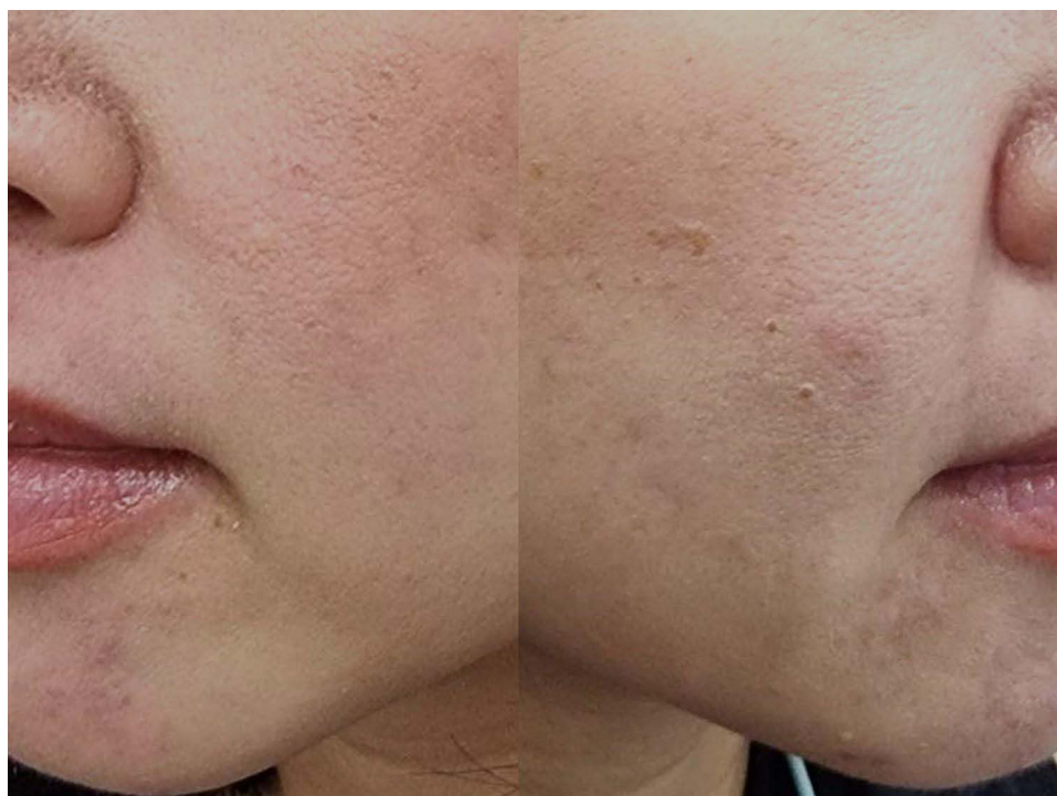
Figure 5 Post-inflammatory hyperpigmentation with comedones and some inflamed papules on both cheeks and chin. (Case 3).

permethrin cream 5% for 10 weeks. After the treatment, the patient still had post-inflammatory hyperpigmentation with comedones and some inflamed papules on the cheeks and chin (Figure 5).