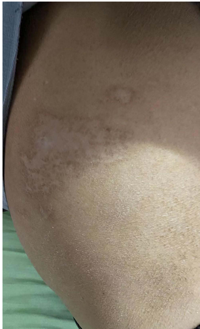
Figure 2 Depigmentation in the intercostal region.

the sacrum area. There were 4 cases were with sunken scar (see Figure 4 ), among whom 1 case was infected in the trigeminal nerve area, 2 cases were in the intercostal nerve area, and 1 case was in the sacrococcygeal plexus area. There were 5 cases with pigmentation with sunken scar, among whom there was 1 case with pigmentation in the trigeminal nerve plexus, 2 cases in the intercostal nerve area, 1 case in the cervical brachial plexus area, and 1 case with pigmentation combined with hyperplasia in the intercostal nerve area. The statistical results show that there were no statistically significant differences in the types of skin lesions among patients of different genders, sites, and ages ( P > 0.05 ). See Table 2 for details.