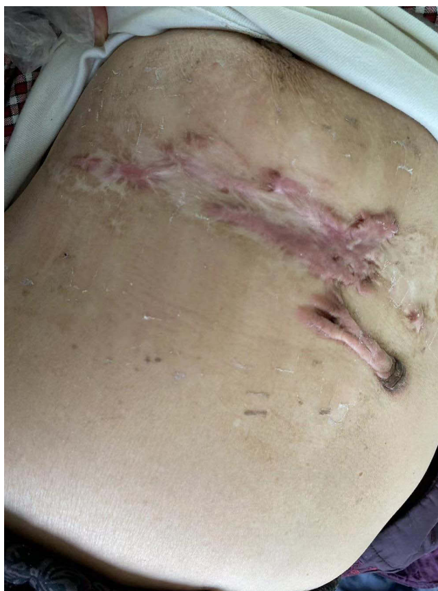
Figure 3 Hypertrophic Keloid in intercostal region.