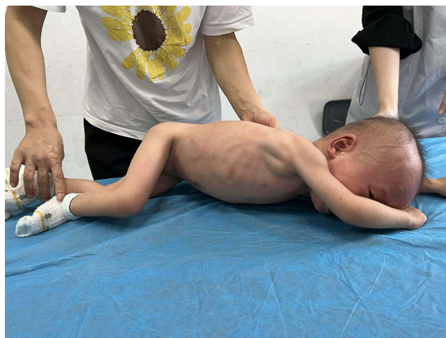
Figure 4 Inconsistent head circumference, abdominal circumference, height and weight, and abnormal posture observed in the child.

Due to the multi-system abnormality, we performed whole exome sequencing, and the results showed one pathogenic variant of MAP2K1 (Figure 5), specifically chr15: 66436843-66436843, exon3, NM_002755.4:c.389A>G:p.Y130C, missense variant. Two pathogenic variants with unclear significance were also found in the gene detection. These were: ATP2B3 chrX:153541460-153541460, exon4, NM_001001344.3:c.310G>A: p.E104K, missense_vari, hemizygote and CDC42BPB chr14: 102963077-102963077, exon20, NM_006035.4: c.2805A>C: p.K935N, missense_vari, heterozygosis; the mutation types of these pathogenic variants are missense mutation, mutation rate: 8.38054372967718e-06 and 3.32336e-05, respectively, and the mutation rating is VUS, indicating that the clinical significance is unknown. The MAP2K1 gene validation test results of the parents were all normal.