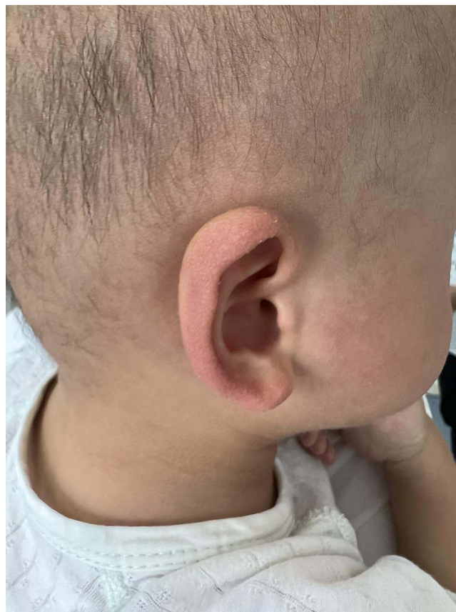
Figure 3 Skin of the auricles and the front of the ears observed in the child.