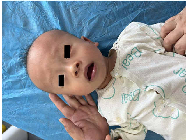
Figure 2 Craniofacial features of the child.

There were abnormalities in the child's craniofacial and skin features (Figure 2), including a slightly wide forehead, a short face, sparse eyebrows, narrow coloboma of eyelids, and a hypertrophy and depressed bridge of the nose. The child had a long philtrum, with a wide mouth, low ear position, and rough skin. The skin of the auricles, the front of the ears, and on the extended surface of the limbs felt grainy like sand (Figure 3).