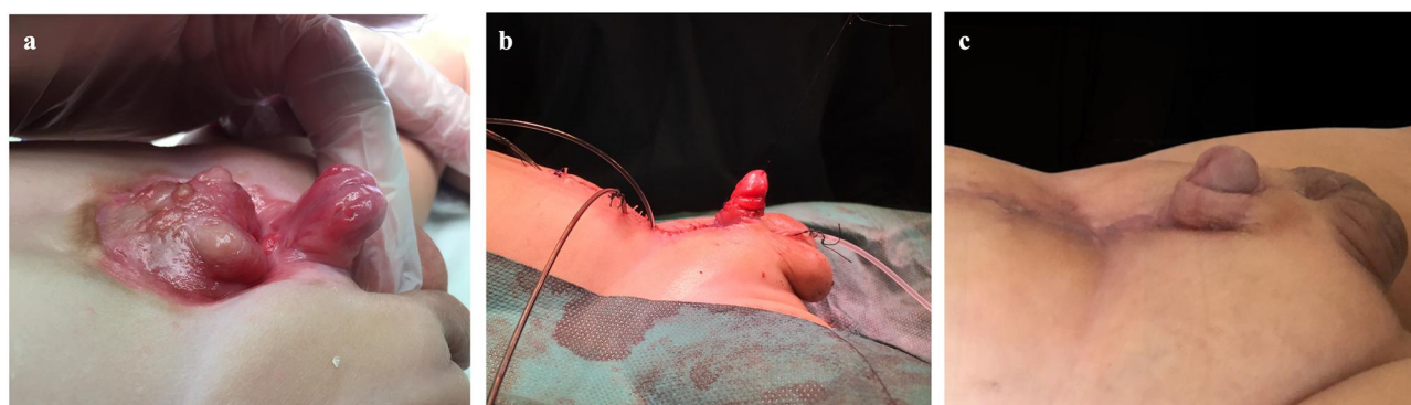
Figure 1 One-stage delayed bladder closure and radical soft-tissue mobilization (Kelly procedure) in a 5-month-old boy with bladder exstrophy repair. (a) Preoperative aspect of the bladder plate and external genitalia. (b) Immediate postoperative results. (c) Aspects of the external genitalia at the 1-month follow-up.

The second measurement was performed after the full mobilization of the left corpus (Figure 2b). The periosteum of the left ischiopubic rami was incised and peeled away to allow the full mobilization of the ipsilateral corpus. Since ICG half-life is between 150–180 s, this helped to identify the neurovascular pedicle exiting the Alcock's canal.