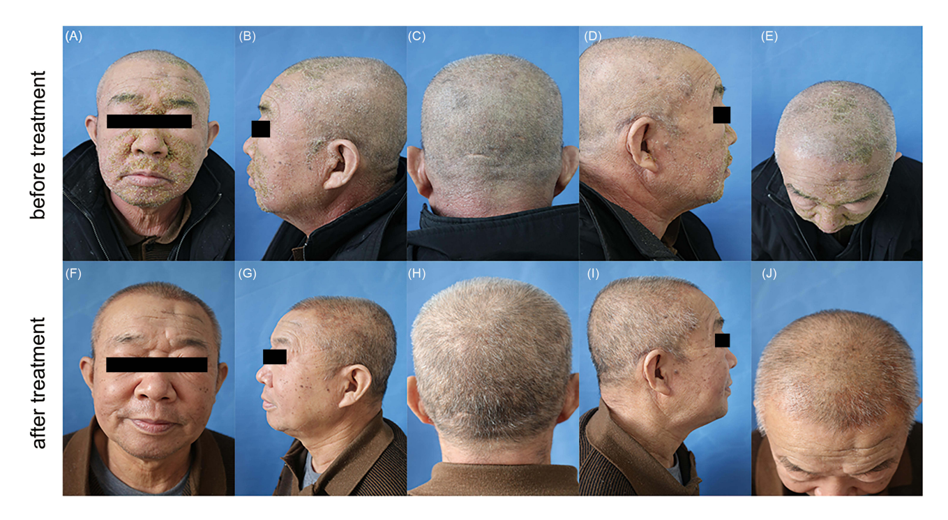
Figure I Clinical appearance before and after treatment. (A-E) Densely distributed serous crusts were seen on the head and face of the patient, diffuse erythema with unclear boundaries on the neck, and slight edema of both eyelids before treatment. (F-J) The patient's rashes all subsided after treatment.