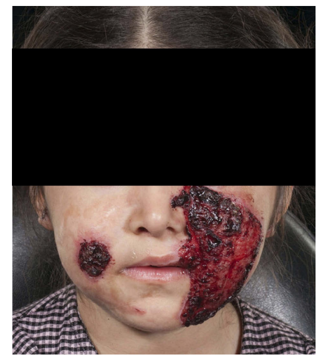
Figure 6 Chronic facial wound in a child with LOC syndrome.