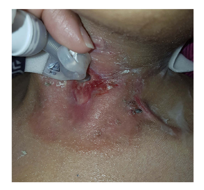
Figure 7 Tracheostomy with a chronic wound around the stoma site in a patient with LOC syndrome.

example Mepitel<sup>®</sup> or Adaptic Touch<sup>™</sup>) where wide strips can be used underneath the tracheostomy ties to prevent friction and embedding into the neck of the ties. Allevyn tracheostomy dressing (Smith & Nephew) has non-adherent and absorbent properties work to control excess moisture from secretions. It is important to note that the adherence of these dressings may be too strong for the fragile skin in this area and care to avoid dressing-related damage should be taken. This can be done with the use of adhesive removers during tracheostomy change. As with other subtypes of EB, tracheostomy care in paediatric patients with JEB is recommended under specialist guidance.<sup>8</sup>