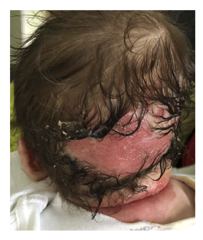
Figure I A chronic head wound with significant exudate in a neonate with JEB-GS.

There are several formulations of honey-based topical gels available for patient use. Honey-based topical gels are widely used in all types of JEB, however not all patients tolerate it due to reported stinging on broken skin. Honey works by the action of osmosis, therefore patients may feel a "drawing sensation" which some children find painful. As such, it is not recommended for extensive application on a neonate or young child and should be done with guidance. Melloxy<sup>®</sup> wound gel is a mix of 40% honey with ozonated vegetable olive oil, thus providing less of a sting than pure honey formulas. We advise patch testing before applying to large, chronic wounds. Babies with JEB often present with wounds on bony prominences towards end of life, that are painful to dress and/or patients may no longer tolerate extensive dressing changes. Honey-based gels such as Melloxy can be used in this instance. Honey is also effective in controlling odour which can be a particular issue for JEB children.