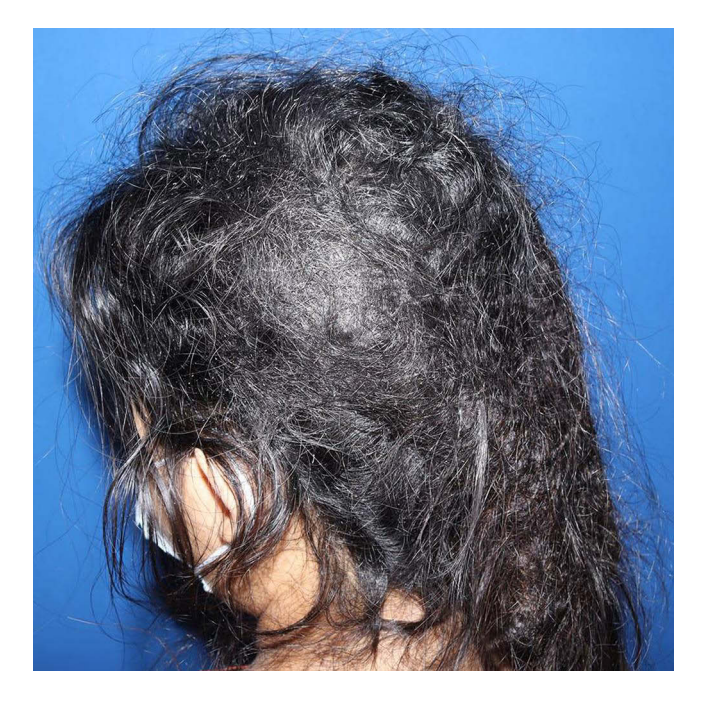
Figure I Compact and stiff masses of hair in the vertex, parietal, and occipital scalp areas.

Two days after the dermatological examination, the patient visited the psychiatric outpatient clinic with her mother. Regarding psychological evaluation by a psychiatrist, the patient is an unmarried woman, educated up to 3rd year of university. She belongs to a broken family of middle socioeconomic status and resides in an urban area. She had no prior substance abuse history. As informed by her mother, who stated having a distant relationship with the patient, the patient had behavioral changes for six years, but this was the first time for psychiatric consultation. The patient appeared healthy until age 26 when her personality started to change gradually. Three years ago, the patient developed symptoms, including self-muttering and occasional irrelevant speech and became increasingly isolated. Her sleep was also disturbed, and she continuously took over-the-counter medications for insomnia; however, her sleep disturbance still occurred intermittently. Her mother informed us that her personal care was regular except for her refusal to use a hair dryer for approximately one year because she said she always heard voices of a woman speaking to her and warning her of severe illness from the hair dryer use. On mental status examination, the patient was alert but had difficulty concentrating on