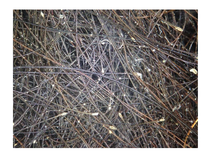
Figure 2 Trichoscopic examination demonstrating fractured hair, trichorrhexis nodosa, and telogen roots embedded in the hair mass.

a target idea. Longer thinking latencies were observed. Cognitive functions were impaired, including memory, thinking, and concept formation. She revealed an inappropriate smile, and her speech was sometimes irrelevant and scanty. According to her history and mental state examination, the patient revealed bizarre delusion and disorganized speech, as presented on the day she visited the dermatological clinic. She also had an auditory hallucination, as she still complained of a woman telling her the negative impact of the hair dryer use, and negative symptoms, manifested as a reduction in facial and vocal expression and decreased interest in activities she used to enjoy. Therefore, the patient was diagnosed with schizophrenia by the psychiatrist and prescribed olanzapine (20 mg/day).