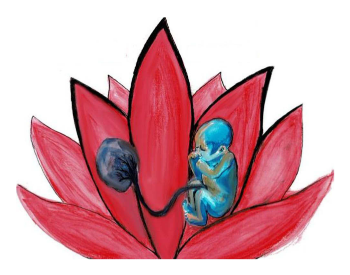
Figure 3 Lotus birth illustration.

placenta together and ensure no pulling on the cord, fear of infection and jaundice.<sup>39</sup> Most participants hid or buried the placenta after separation. There were no reported newborn infections and 1 report of jaundice.<sup>39</sup>