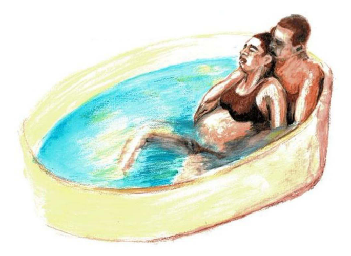
Figure 2 Water birth or immersion illustration.

land or in water). Immersion in warm water has been used for both pain relief and relaxation and has been used in both the first and second stage of labor.<sup>29</sup> Immersion in water may help pain by allowing the parturient to move more freely than on land and position themselves comfortably. It may also help with pain by inhibiting pain signaling pathways.<sup>29</sup>