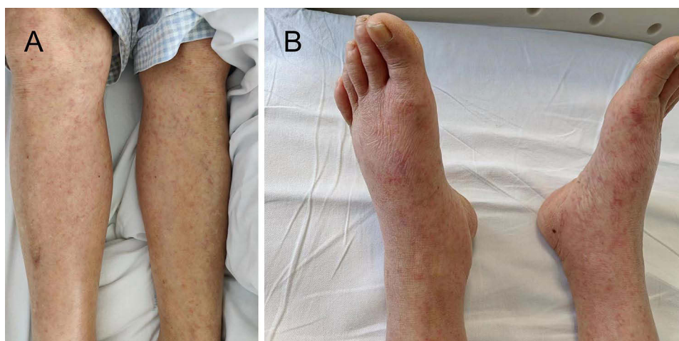
Figure 1 Erythematous rashes scattered on the legs and feet (A and B).

On day 6, further tests revealed that the platelet count decreased to 20 \times 10^9/L and eosinophil levels continued to decrease to 0. The levels of inflammatory markers (CRP, PCT, IL-6, IL-10, and IFN- \gamma ), liver enzymes, and lactic acid were significantly increased. The coagulation function became abnormal, and even central nervous system symptoms occurred. Physical examination revealed neck rigidity, and the pathological reflex was positive. No wound, rash, or eschar were detected. Cerebrospinal fluid examination and bone puncture results ruled out intracranial infection and hematological diseases, respectively. In addition, epidemic hemorrhagic fever antibody, 3P protamine test, Coombs test, platelet antibody and ADAMTS13 activity test were all negative. Severe fever with thrombocytopenia syndrome virus (SFTSV) was excluded as a cause. Doxycycline (0.2g twice daily) was used for tick-bite-related illness. The patient accepted steroid and gamma globulin for treatment of severe thrombocytopenia. The presence of R. japonica was detected by mNGS from the peripheral blood on day 9. A total of 127 sequence readings of R. japonica were detected on the MGI-200 platform, accounting for 0.48% of the genome coverage. Finally, the patient was diagnosed with JSF. Rashes developed on the limbs on day 13, but eschar was still not found (Figure 1). The patient completed a 3-week course of doxycycline and exhibited good prognosis (Table 1, Figure 2).