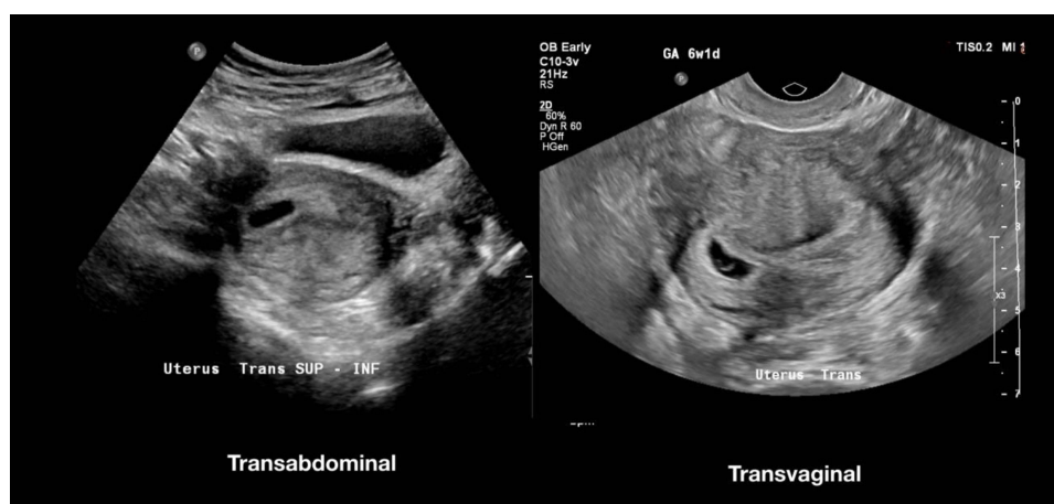
Figure 2 Transabdominal and transvaginal image of one study wherein the two ED physicians disagreed about the presence or absence of an intrauterine pregnancy on transabdominal imaging.

Out of the 108 total included patients, there were two ectopic pregnancies. In both of these cases, each of the emergency physicians noted the absence of an IUP. There were no cases of heterotopic pregnancy in this cohort. If the patients who had an identifiable IUP on TAUS had not received TVUS, it would have resulted in a theoretical reduction of TVUS performed on this patient cohort by 54% (EP 1) or 63% (EP 2). This is shown in Table 7 .