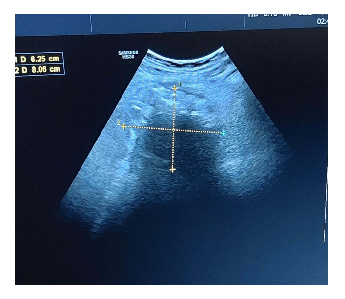
Figure 3 Abdominal ultrasound showed a 7×7.7cm large and ill-defined homogeneously shadowing left lower abdominal mass lesion with increased adjacent mesenteric fat reflectivity.

Any type of surgery can be a reason for retained surgical gauze but typically after hysterectomy, appendectomy, and cholecystectomy.<sup>5</sup> Risk factors associated with sponge retention are emergency surgery, unexpected change in the surgical procedure, poor organization of operating team, hurried sponge counts, prolonged operations, unstable intraoperative patient condition, inexperienced staff, inadequate staff numbers, and obesity.<sup>6</sup> With a lack of reporting due to the medico-legal repercussions, it is difficult to estimate the exact incidence of retained surgical sponge at operation. But one out of 1000-1500 intra-abdominal procedures and one out of 300-1000 total operations are thought to have gossypibomas. Since Wilson first described gossypiboma in 1884, numerous reports have been written and published