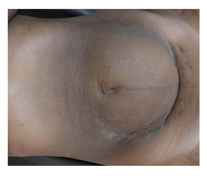
Figure 2 Lower abdominal mass with suprapubic transverse scar (AP view).