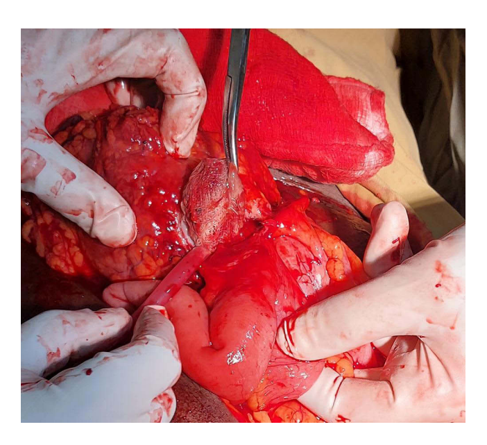
Figure 5 One big piece of gauze with 200 mL of thick offensive pus in a well-formed cavity; the gauze had eroded the antimesenteric side of the involved ileum 100 cm proximal to the ileo-cecal valve with 0.5\times0.5 cm size perforation.

in the literature. But when more current data appear in the literature, it appears that this issue still has to be resolved after intra-abdominal procedures. <sup>7,8</sup>