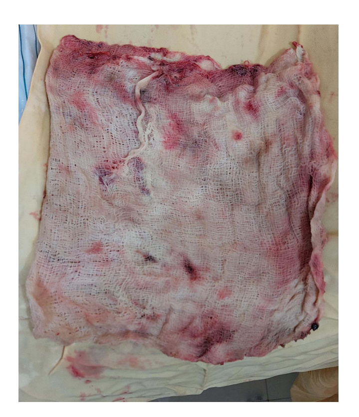
Figure 7 Removed surgical specimen containing surgical gauze soaked with pus.