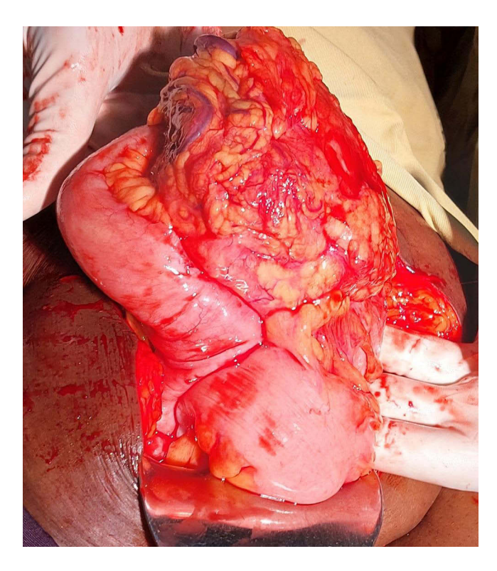
Figure 4 A mass formed by the omentum, mid-ileum, and descending and sigmoid colons.