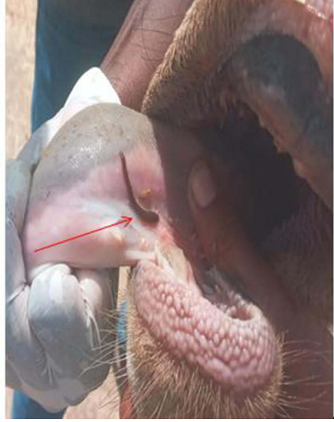
Figure 2 Leech attached on the tongue of cattle (see the arrow).