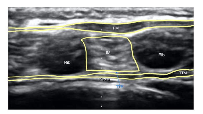
Figure 2 Deep parasternal nerve block anatomy visualized with high-frequency linear probe prior to injection, showing respectively the pectoralis muscle (PM), intercostal muscle (IM), transversus thoracic plane (TTP), and transversus thoracic muscle (TTM).

and VAS for children over the age of 8 years. Post-operative pain scores and intravenous opioid consumption were recorded for the first 24 hours after surgery.