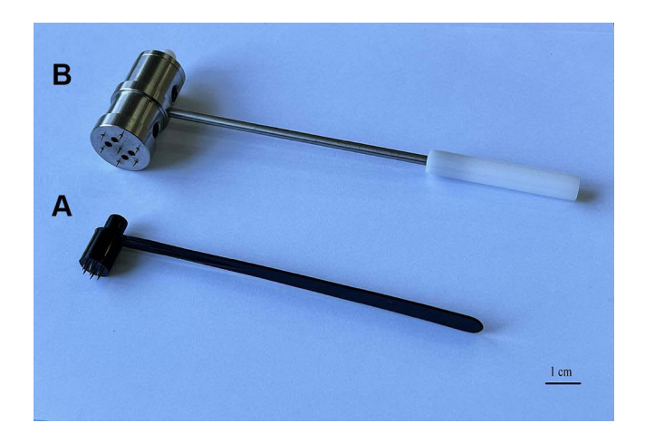
Figure I (A) conventional plum blossom needling (PBN); (B) novel plum blossom needle with mild moxibustion (PBNMM).

Moxibustion has been utilized for more than 2000 years in China as a form of preventive medicine, as well as for disease treatment. Presently, mild moxibustion (MM), one of the most popular forms of moxibustion application, is a technique that involves warming the skin and subdermal tissues using aged moxa floss that has been ignited and suspended over acupoints at a comfortable distance. MM, also known as indirect moxibustion, is a gentle and safe procedure with broad clinical applications, and it has also been explored as an adjunctive component in the rehabilitation of patients suffering from PS-SHS.<sup>8,29</sup> Radiant heat, as well as chemical components liberated in volatile oils, other vaporized substances and moxibustion smoke (MS) generated through the combustion process, have been reported as being potential factors that drive the clinical effects of MM.<sup>30–33</sup> Moxibustion utilized for PH-SHS rely on its favorable effects for regional skin congestion improvement, capillary expansion, activations of blood and lymph circulation, sedation and analgesic nature.<sup>34,35</sup>