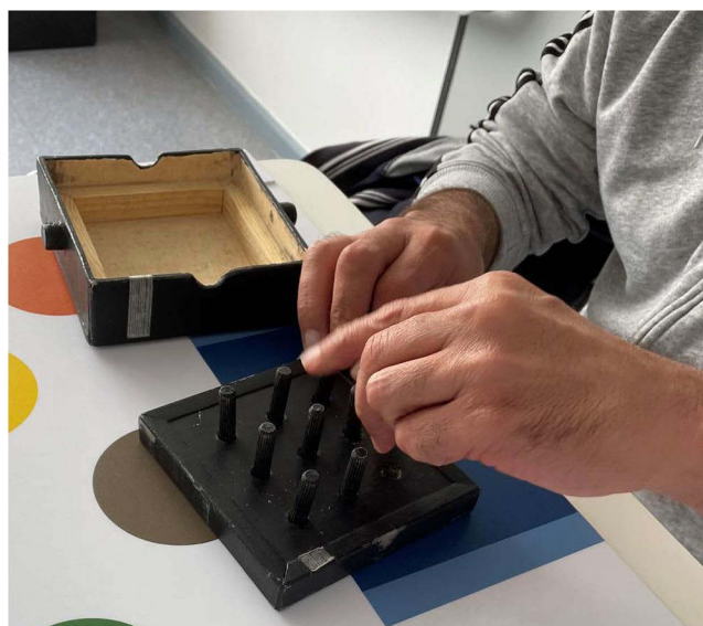
Figure 4 9 Hole Peg test.