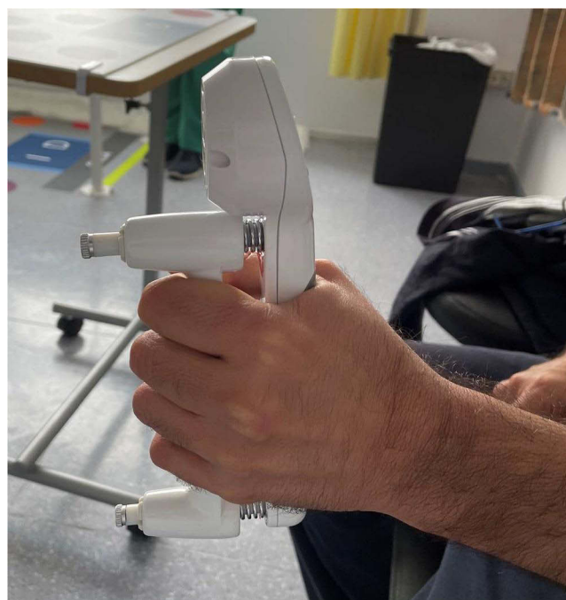
Figure 3 Dynamometry test.