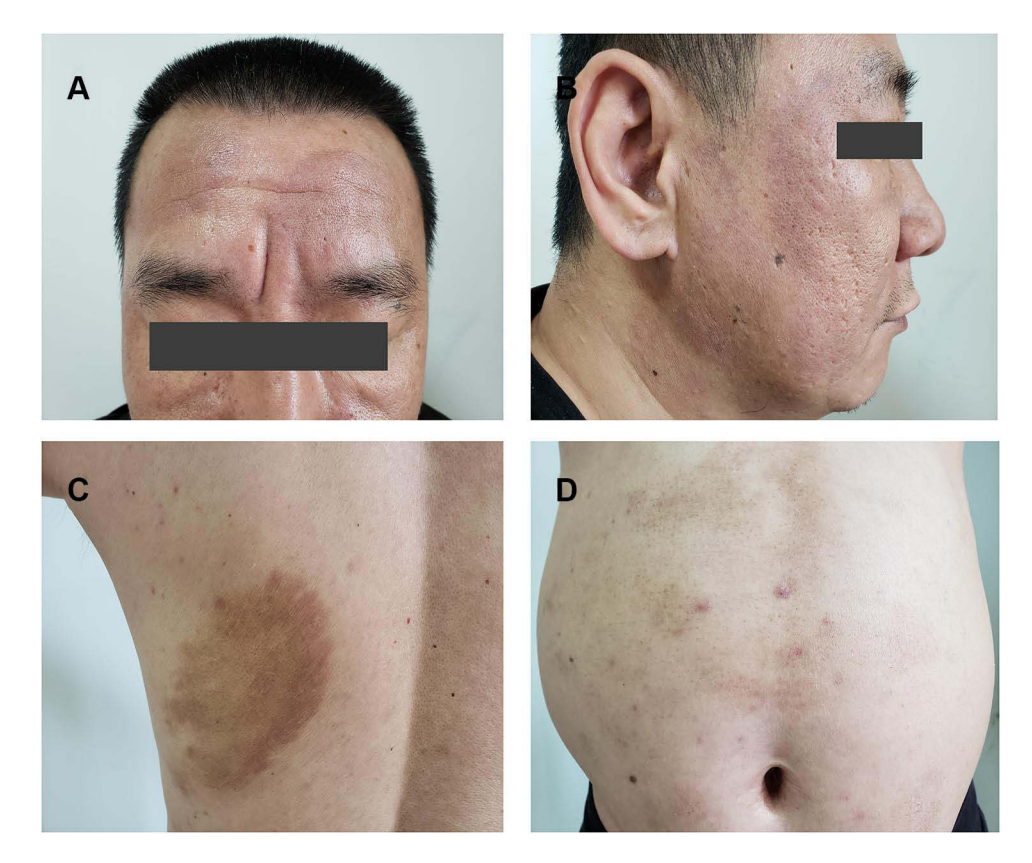
Figure 3 Resolution of lesions. The lesions on the face (A and B), abdomen (C) and back (D) subsided, leaving behind pigmentation.

other diseases have been reported, such as EPF associated with cutaneous angiosarcoma, EPF associated with pregnancy and EPF associated with herpes zoster.<sup>2–4</sup> While the pathogenesis of EPF remains uncertain, various studies indicate that Th2-mediated immunologic mechanisms and prostaglandin D2 (PGD2) are involved in the pathogenesis of EPF. Th2 cytokines, such as IL-4, IL-5 and IL-13, promote the production of eosinophil chemokines via the component cells of the skin (such as lymphocytes).<sup>5</sup> Additionally, PGD2 and its metabolite 15d-PGJ2 induce eotaxin-3 upregulation in sebaceous gland cells, leading to the infiltration and activation of eosinophils in the pilosebaceous units.<sup>6</sup> Furthermore, indomethacin not only inhibited eosinophil migration to PGD2 and eotaxin, but also the initiating effect of 15d-PGJ2. Therefore, it can be concluded that the drug was effective in treating this case of EPF.