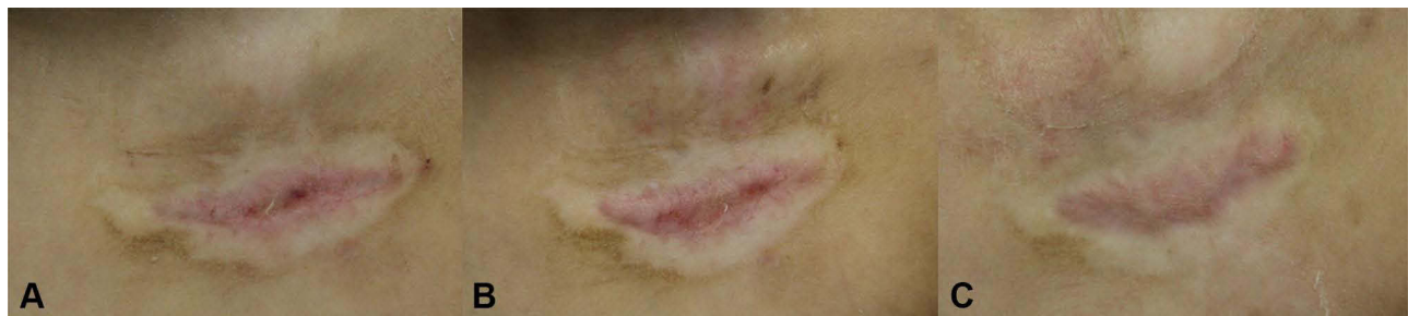
Figure 2 Female, 7 years old, (A) 1s one month post-treatment, (B) 1s three months post-treatment, and (C) 1s six months post-treatment.

The incidence of complications in the laser combined with tension reducer treatment group was 55%, and four patients showed skin breakage and one rash when using the tension reducer, etc. No significant complications occurred in both groups of patients using the laser.