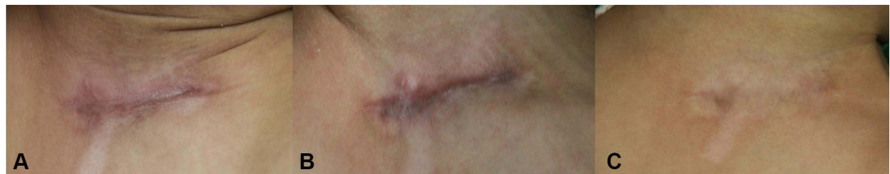
Figure 3 Female, 2 years old, (A) 1s one month post-treatment, (B) 1s three months post-treatment, and (C) 1s six months post-treatment.