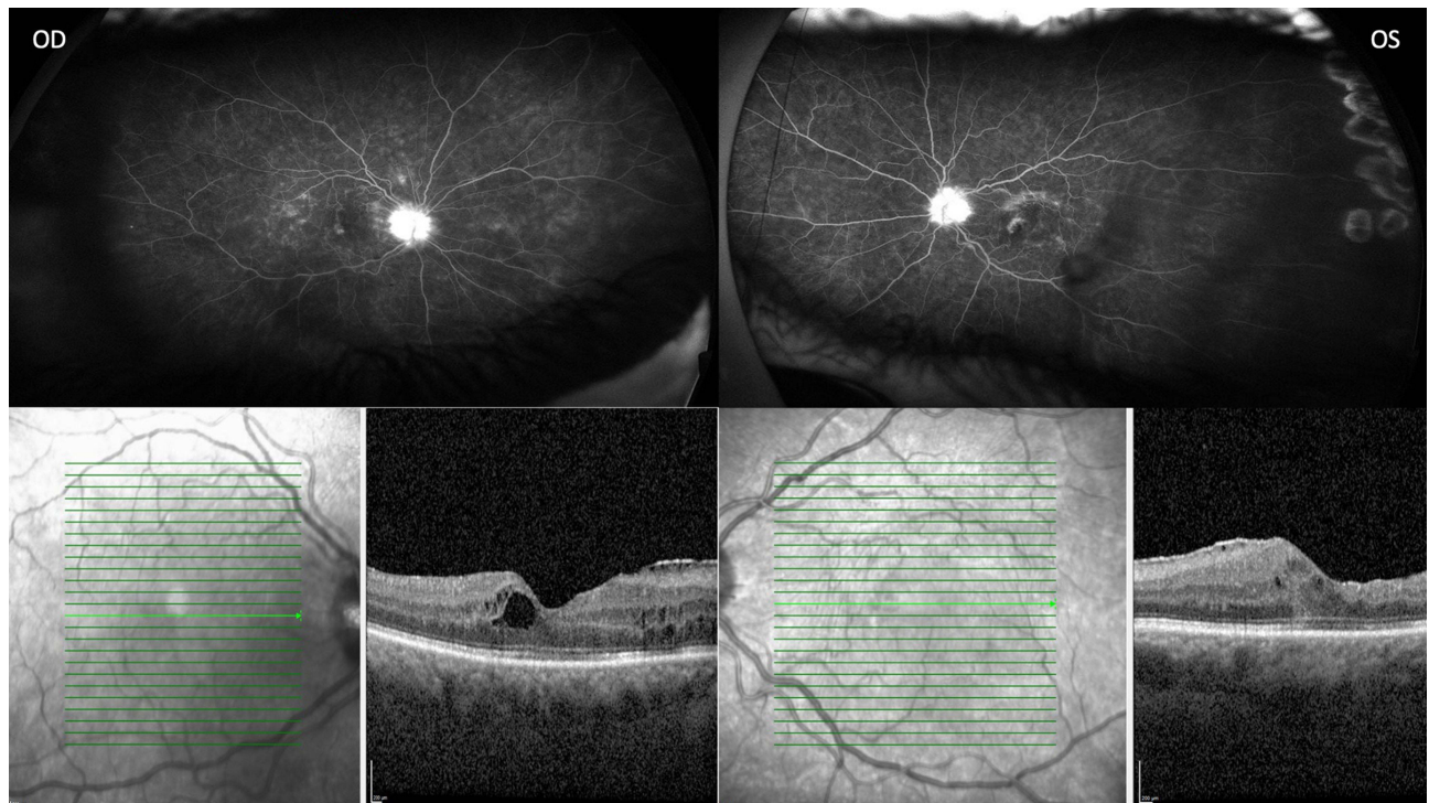
Figure 2 Persistent inflammation 6 weeks after Ozudex OD and 8 weeks after Ozurdex OS, widefield fluorescein angiography (Optos) and optical coherence tomography. Bright green line indicates section of image provided and green arrow has no significance.