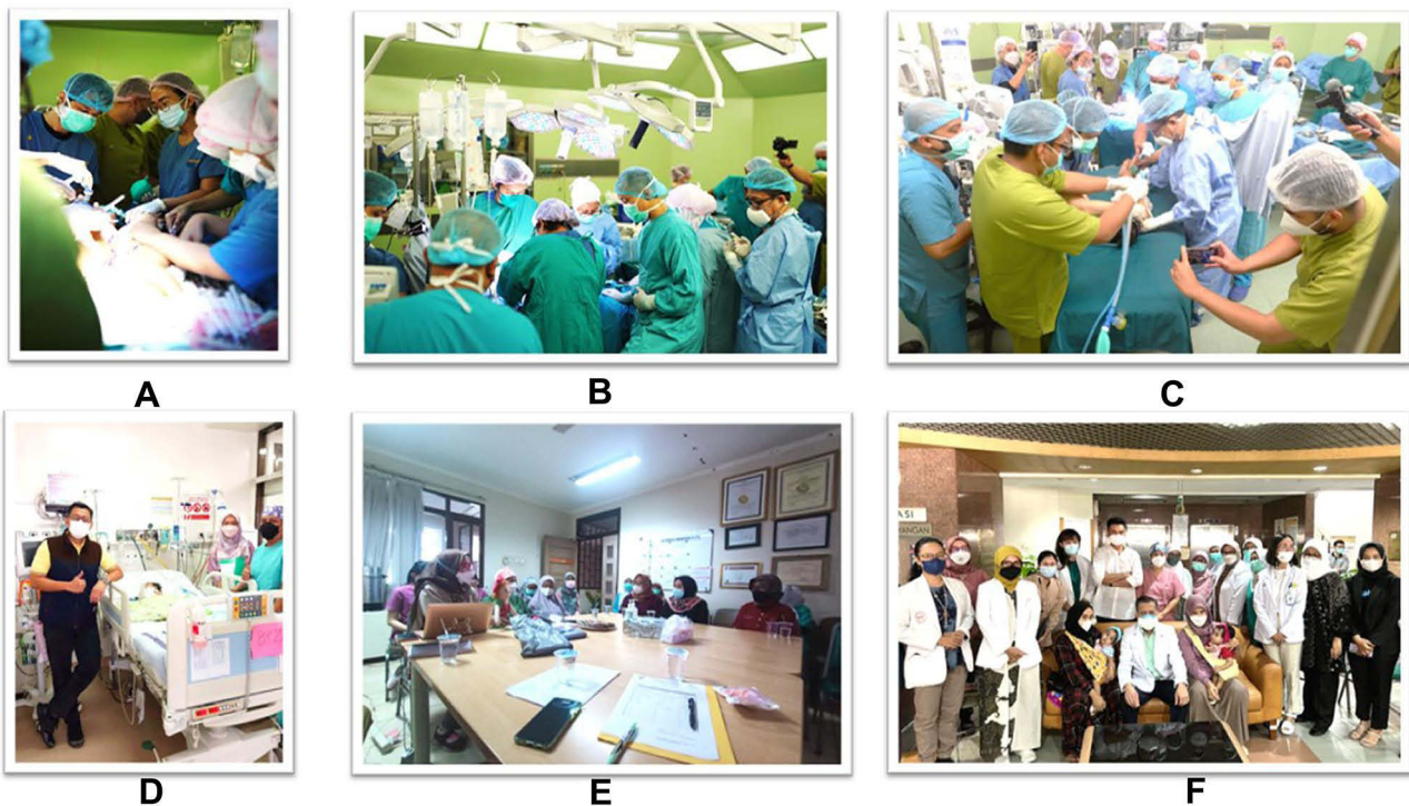
Figure 3 Conjoined Twins Separation. (A) Anesthesia induction. (B) Surgery, note that the surgical team leader (doctor with glasses) continuously supervises different surgical departments. (C) Twins separated, note that team pink and team blue (marked by colored hair caps) were focused only on one twin each. (D) Pediatric critical care. (E) Discharge meeting with parents, rehabilitation specialist, pediatrics, and social worker. (F) Discharge.

online discussion link (Zoom app; USA), where students could follow the surgery without being present in the operating room. 24 Later, both children were sent to pediatric intensive care for further treatment (Figure 3).