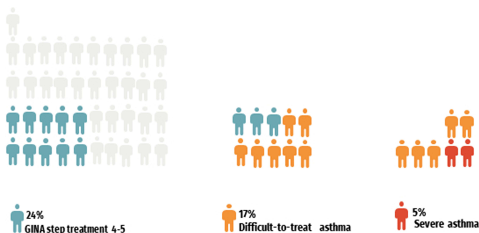
Figure 3 Waffle chart with the proportion of asthma patients per subset of asthma severity.

Abbreviation: GINA, Global Initiative for Asthma.