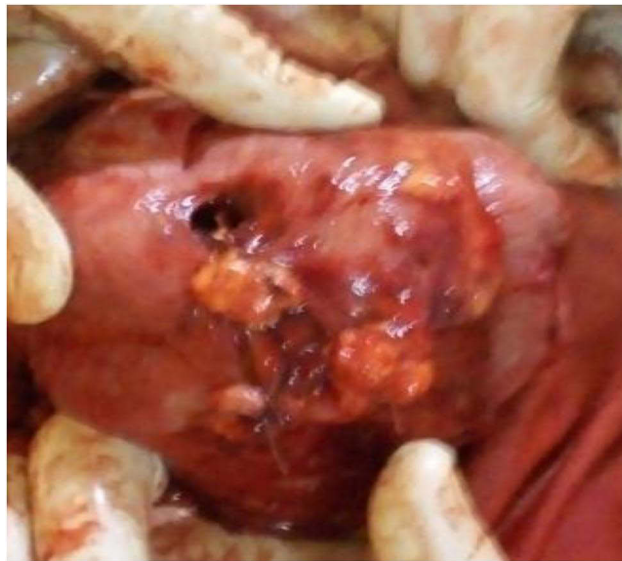
Figure 2 Intraoperative photographs of fundal niche with the surgeons glove visible and anterior uterine wall fibro-fatty adhesion (released) and lower uterine segment transverse cesarean section hysterectomy incision.

there was neonatal meningitis, which was treated for 21 days and cured. Fortunately, both the mother and the newborn were discharged safely.