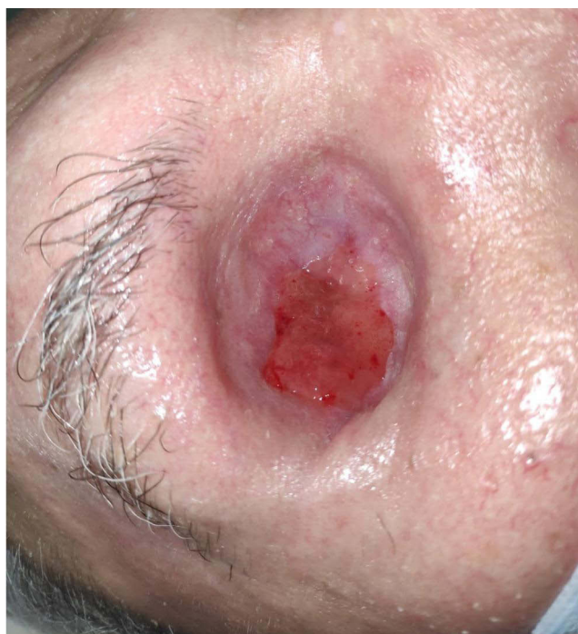
Figure 3 Wound Aspect during the follow-up. Wound healing with partial epithelization at 7 months post-surgery.

After surgery, intravenous isavuconazole was maintained for one more month with a subsequent switch to oral therapy (200 mg/day). Blood glucose levels were always kept under 180 mg/dL with insulin therapy for the duration of the stay in the ward.