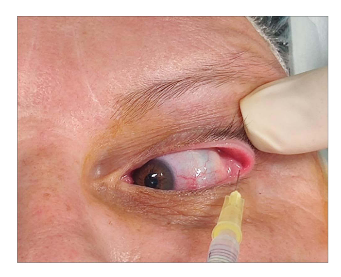
Figure 2 Transconjunctival injection of the left lacrimal gland palpebral lobe with 6 units of botulinum toxin A.

Two weeks after the transconjunctival injection of 6 units of botulinum toxin in the palpebral lobe of the left lacrimal gland (Figure 2), the patient reported a decrease in perceived tearing, and 1 month after the treatment there was an almost complete resolution of the complaints.