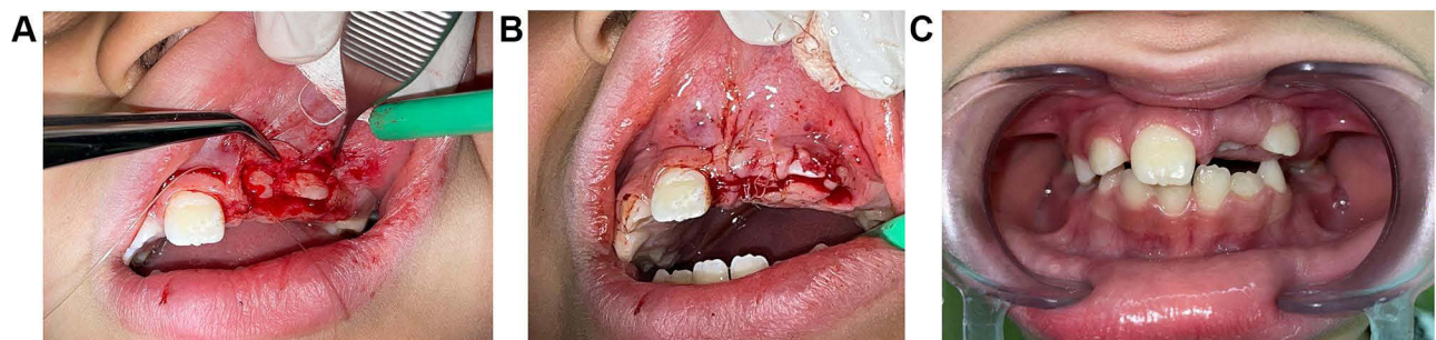
Figure 2 Clinical Photographs: (A) Intra-oral photograph shows raised the buccal flap and exposed upper permanent central and lateral incisors. (B) Intra-oral photograph shows the apical repositioned flap sutured opposite to the tooth 21, 22 using 3/0 Vicryl absorbable suture materials. (C) Intraoral photograph acquired at one-month recall shows partially erupted and lingually positioned #21 and good eruption of #22.

At postoperative 1-month follow-up, clinical examination showed that #21 had erupted palatally and that only its incisal tip was visible. Also, the tooth (#22) erupted in a good position ( Figure 2C ). The patient was followed up for future orthodontic treatment to correct the anterior crossbite. At the six-month recall visit, clinical examination showed self-correction of anterior crossbite (tooth #21). Enamel hypoplasia of the cervical part of the crown was also seen ( Figure 3A ). The periapical radiograph showed that the root was still immature which indicates a chance for more eruption ( Figure 3B ).