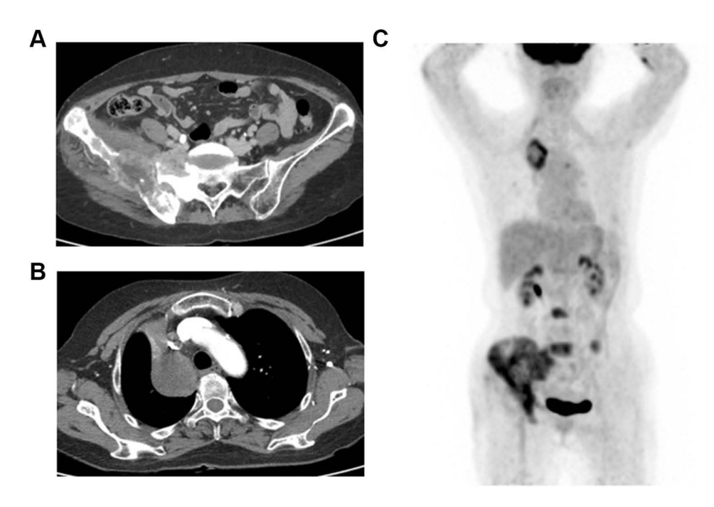
Figure I Radiologic images at diagnosis. Computed tomography (CT) angiography of the lower extremities showed osteolytic and sclerotic lesions with extraosseous mass formation at the right iliac bone (A). Chest CT scan showed a 6.2×4.3 cm sized mass in the right upper lobe abutting the right brachiocephalic vein (B). Positron emission tomography confirmed the hypermetabolic mass at right upper lobe and multiple bone metastases at right iliac and ischial bone, right sacrum, left iliac bone, and lumbar spines (C).