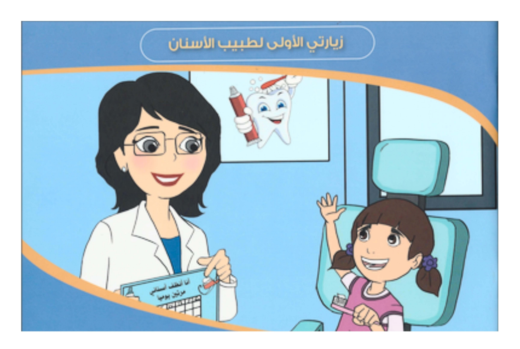
Figure I The cover of the book entitled, "My First Visit to the Dentist".

The American Academy of Pediatric Dentistry reference manual was used to determine the correct answers regarding the parental oral health knowledge.<sup>46</sup>