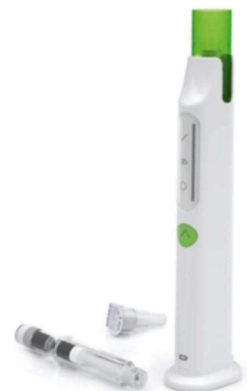
Figure 3 Skytrofa electronic delivery device and its features. 39

SKYTROFA™ (lona-pegsomatropin-tcgd) for injection, for subcutaneous use; 2021. Available from: https://www.accessdata.fda.gov/drugsatfda_docs/label/2021/761177lbl.pdf . SKYTROFA™, Ascendis®, TransCon®, the Ascendis Pharma logo and the company logo are trademarks owned by the Ascendis Pharma Group. 39