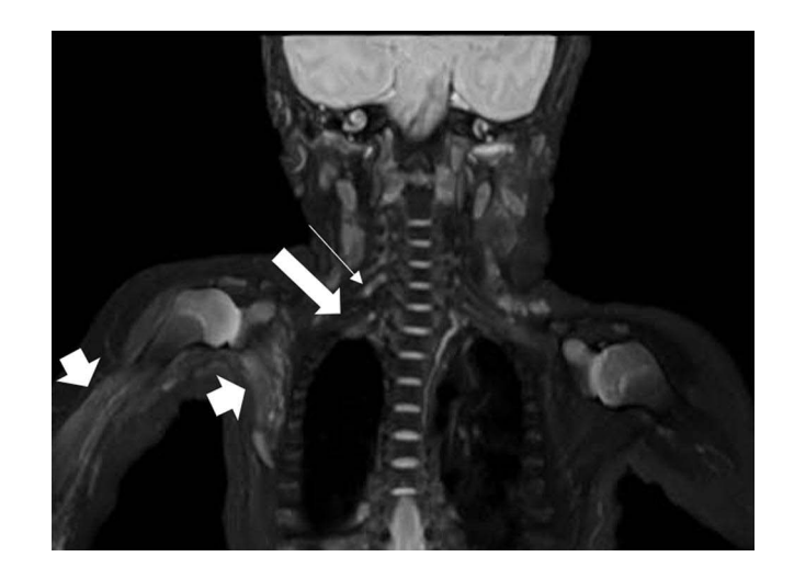
Figure 2 M, 34 days, right upper limb weakness for 1 month. Muscle strength was graded 0. EMG showed neurogenic damage to the right brachial plexus. Coronal 3D-STIR-SPACE image displayed thickening of the right nerve root at C5 and C6 level (thin arrow), right nerve root dissection at C7 and C8 level (thick arrow), and increased signal of right shoulder and upper limb muscles (arrowhead).

suggesting neurogenic damage. In two cases, the action potential amplitude of the musculocutaneous nerve and sensory nerve was diminished. Finally, EMG findings were normal in 3 cases.