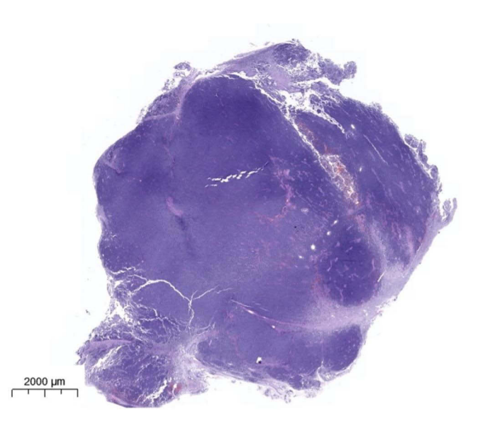
Figure 2 Hematoxylin-eosin stain shows large nodular collections crowded basaloid cells in the dermis.

violaceous nodule without ulceration on sun-exposed area especially on the head or neck in white men was noticed as the common lesion.<sup>4</sup> Other lesions such as subcutaneous masses, pediculated lesions, and telangiectatic papules are also reported.