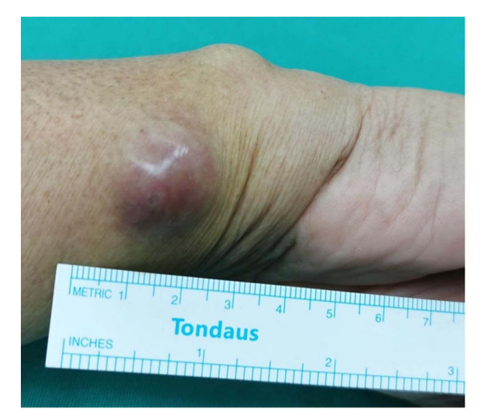
Figure I A red-to-violet subcutaneous nodule sized in the diameter of 2 cm on the right volar wrist.