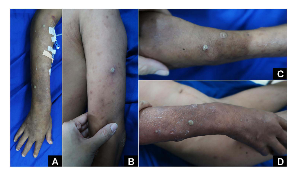
Figure I Pustules on upper extremities (A-C). Pustules, erythematous nodules and shallow ulcers on right lower arm (D).

The patient admitted that he was in psychological distress due to his condition. Physical examination showed pendulous earlobes, moon face, and gynecomastia. There were pustules on the center of erythematous nodules on the extremities (Figure 1A–C), erythematous nodules, and shallow ulcers (Figure 1D). Neurological examination revealed that both ulnar nerves were enlarged and rubbery, without tenderness. There was hypesthesia of the skin lesions on both arms, hands, legs, and feet, without gloves and stockings anesthesia. On slit-skin smear, mean bacterial index (BI) and