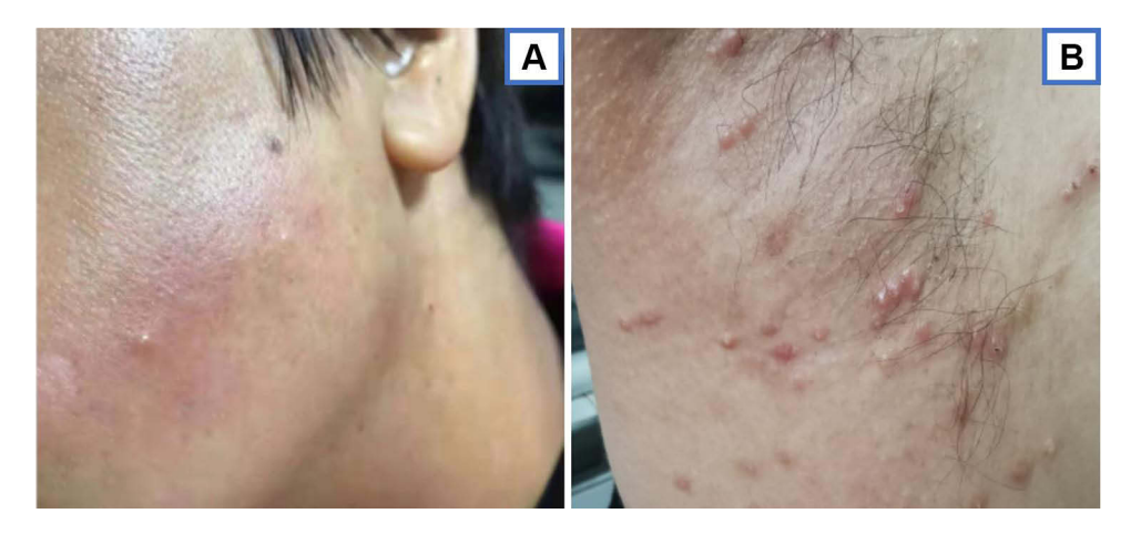
Figure I Painful erythematous papules studded with white blisters on the patient's left face (A) and right axillary skin (B).

effusion showed that her total cell count, percent of segmented cells, percent of lymphocytes, adenosine deaminase, and protein concentration were 140×10<sup>6</sup>/L, 70%, 30%, 3.8 U/L, and 37 g/L, respectively. Her Rivalta test was positive, and the effusion was proven to be exudative. Histopathology of the rashes and the lymph node biopsy specimen obtained from the patient confirmed SS (Figure 2). Candida was repeatedly isolated from the sputum, while microbial cultures of the blood and alveolar lavage fluid were negative. In addition, there were no abnormal findings on bronchoscopy. Following treatment with vancomycin, moxifloxacin, cefoperazone, fluconazole and dexamethasone during hospitalization, the patient's symptoms improved, and the rash subsided. Repeated routine blood tests showed a WBC count of 12.4×10<sup>9</sup>/L, a neutrophil count of 7.92×10<sup>9</sup>/L and a hemoglobin concentration of 108 g/L. Chest CT showed absorption of the pulmonary lesions and pleural effusion. The patient was discharged from the hospital on October 20, 2010. She was continuously treated with oral prednisone and thalidomide outside the hospital, and her condition was stable However, the patient was admitted to the People's Hospital of Guangxi Zhuang Autonomous Region due to a pulmonary fungal infection and SS and was hospitalized from March 2011 to May 2011. Her specific process of diagnosis and treatment was unknown, and she was discharged after her condition improved.