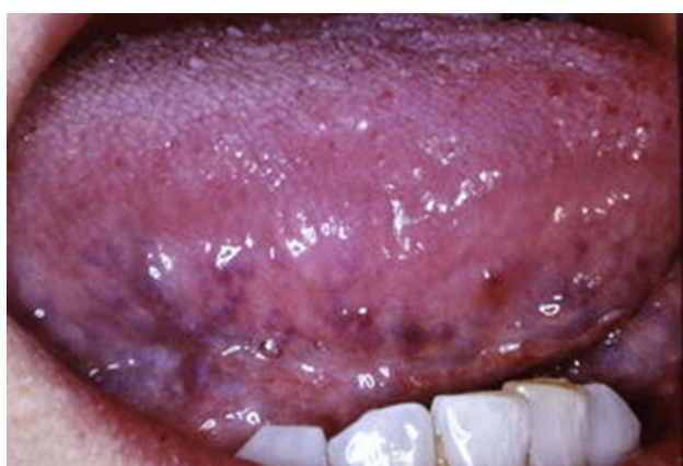
Figure 3 Medium/severe sublingual varices (grade 1). Written consent obtained from patient.

independent variables (hypertension, systolic blood pressure, DM-2, fP-glucose, dyslipidemia, fP-cholesterol, fP-HDL, waist circumference, waist-hip ratio) multiple logistic regression was performed using the enter method where the estimated values were adjusted for sex and age (Model 1) or for sex, age and smoking (Model 2).