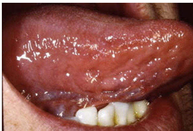
Figure 2 None/few sublingual varices (grade 0). Written consent obtained from patient.