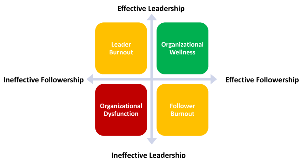
Figure 1 The connection between leadership, followership, and burnout. When effective followers partner with supportive and effective leaders, we see organizational wellness. When effective leaders work with ineffective followers, we see leader burnout. When effective followers want to partner with leaders but have leaders who do not give them the autonomy to do so, we see follower burnout. When neither the leaders or the followers are working in service to the other, we see the whole organization suffer.

feel that their work has true meaning and purpose. 17 While this may seem obvious in health care, there are many times that the workload exceeds the resources and time and sense of purpose can be lost. While still in the follower role, being a partner can optimize an individual's sense autonomy, mastery, and purpose.