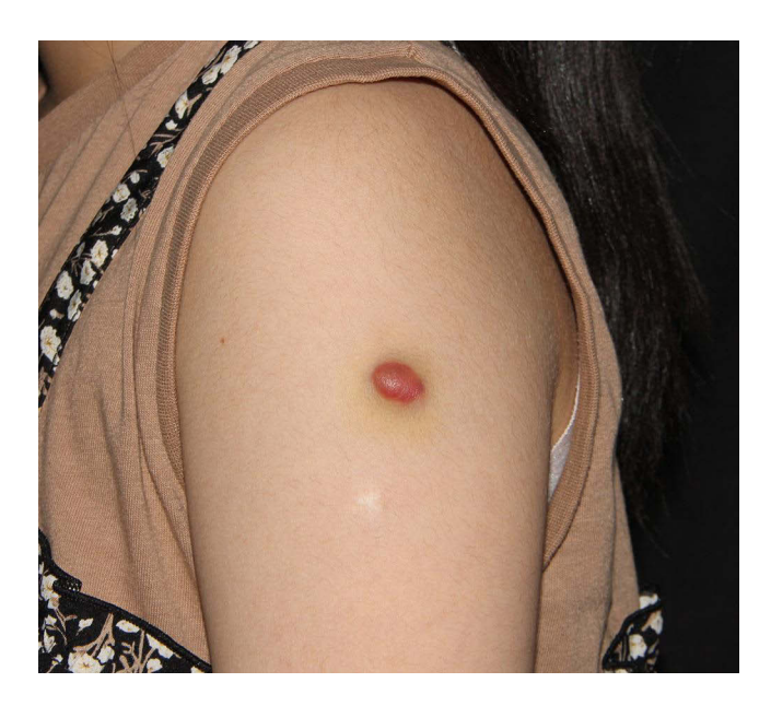
Figure I A pink-colored, 1.0 cm × 0.5 cm-sized, thick-walled, and semi-translucent blister on the extensor aspect of the left upper arm. A 1.5 cm × I cm-sized and welldemarcated firm nodule was detected underneath the blister.