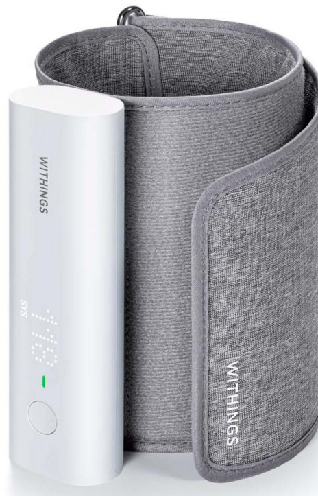
Figure 1 The Withings BPM Connect device.