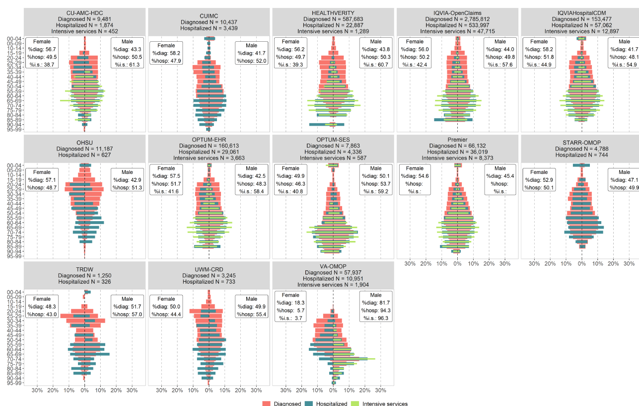
Figure 2 Distribution of diagnosed, hospitalized and requiring intensive services COVID-19 cases by age and sex across the OHDSI COVID-19 network in the United States.

In the USA, the proportion of diagnosed cases generally decreased with age, with most diagnosed cases being within the 25 to 60 age group. The proportion of cases hospitalized and intensive services increased with age, with the highest proportions of cases of hospitalized, or intensive cases in the 60 to 80 year age group (Figure 2). A slightly higher proportion of women were diagnosed than men but a greater proportion of men were hospitalized (and where available, required intensive services) than women in the USA databases. In Europe, databases captured diagnosed or hospitalized cohorts but had limited information on intensive services. In Europe, databases capturing hospitalized cases (HMAR, HM-Hospitales, SIDIAP, and SIDIAP-H) showed a similar trend to the USA databases in that there was a higher proportion of men were hospitalized than women (Supplementary Figure 1). Unlike the USA and European databases, there was also a higher proportion of women in hospitalized cases in the South Korean database (HIRA). Age-wise trends in the European and Asian databases were similar to those in the USA databases, in that the bulk of the diagnosed cases