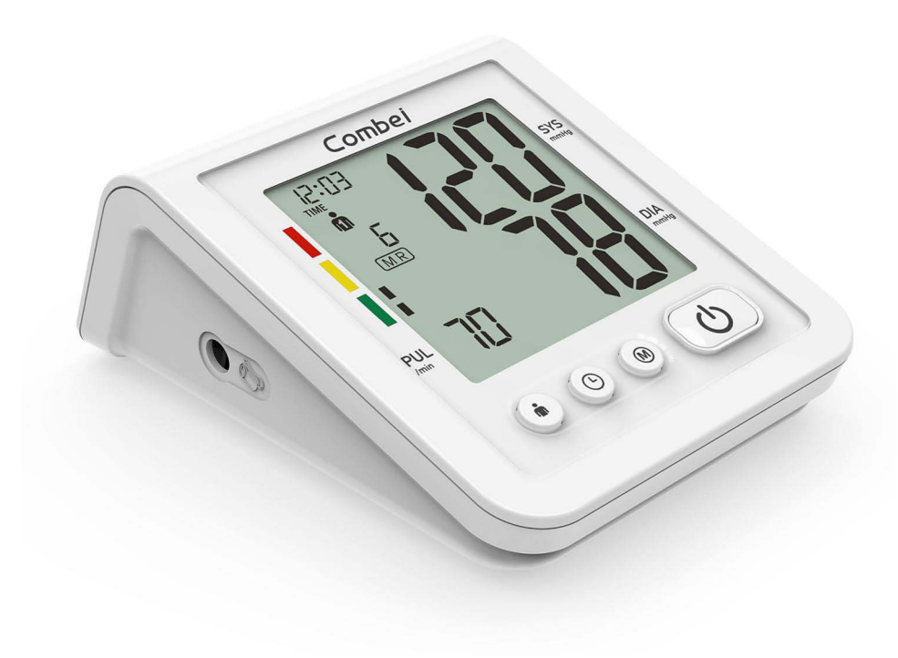
Figure I The COMBEI BPII8A device.