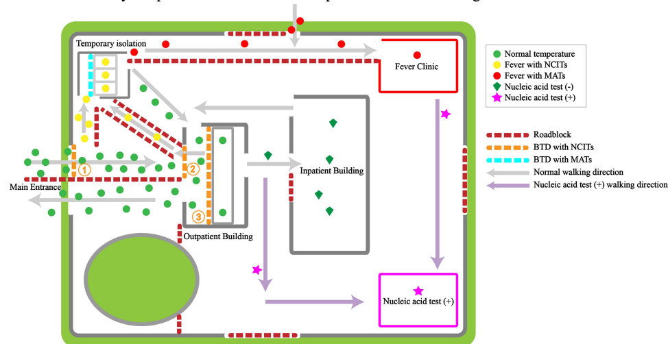
Figure 1 The schematic diagram of body temperature detection-based hospital normalization management under COVID-19.

Abbreviations: BTd, body temperature detection; NCITs, non-contact infrared thermometers; MATs, mercury axillary thermometers.