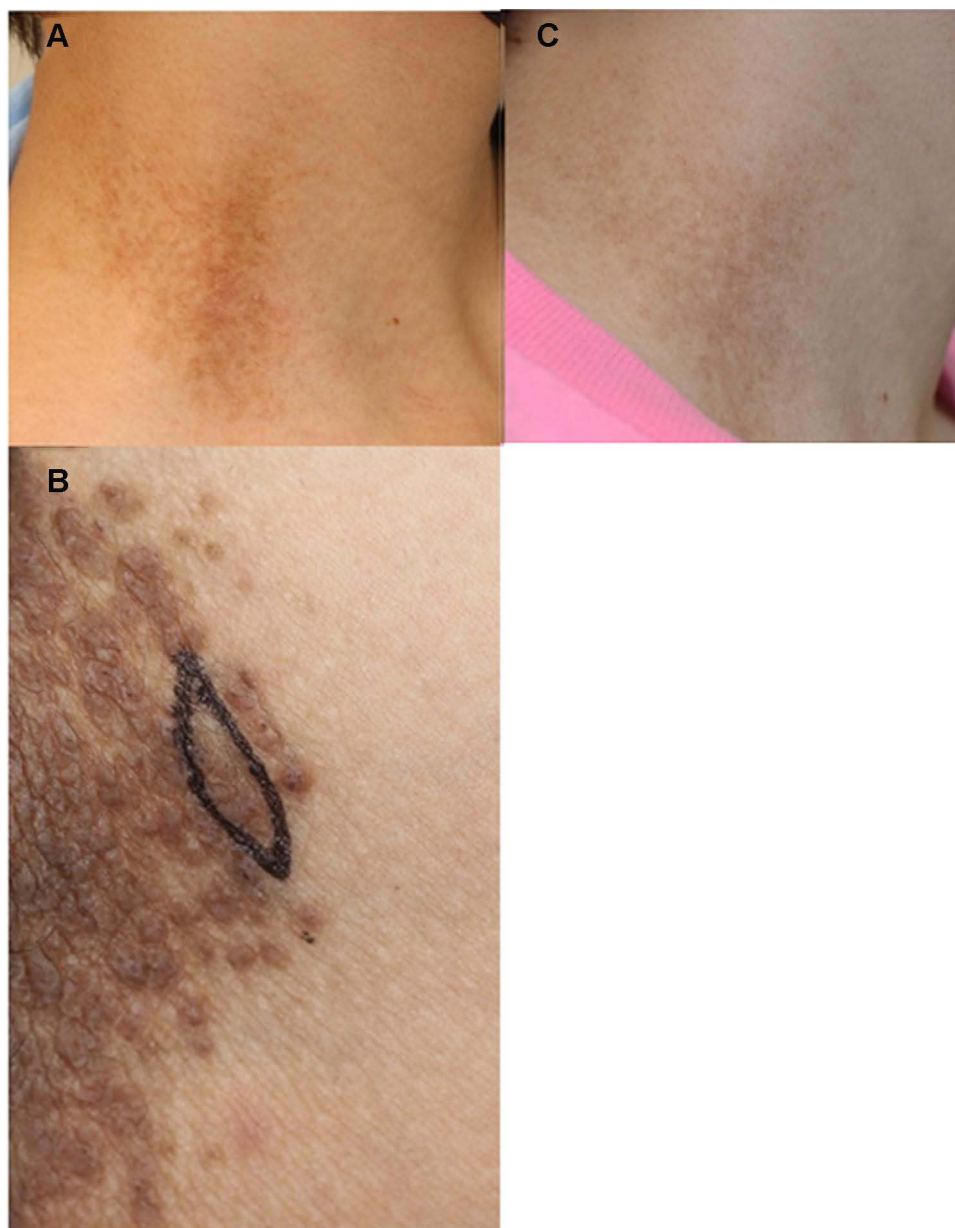
Figure 1 Brown keratotic papules on the neck (A), and a cluster of papules on the groin (B). The improvement of the eruption on the neck after 3 months of treatment with calcipotriol/betamethasone dipropionate two-compound ointment (C).

steroids, but the treatment efficacy was inconsistent. Similar eruptions were observed in her father, younger sister, and daughter. Pathological examination of the inguinal papules revealed dyskeratotic cells, such as corps ronds in the granular cell layer and grains in the horny layer, and acantholytic lacuna just above the basal layer (Figure 2). She was diagnosed with DD.