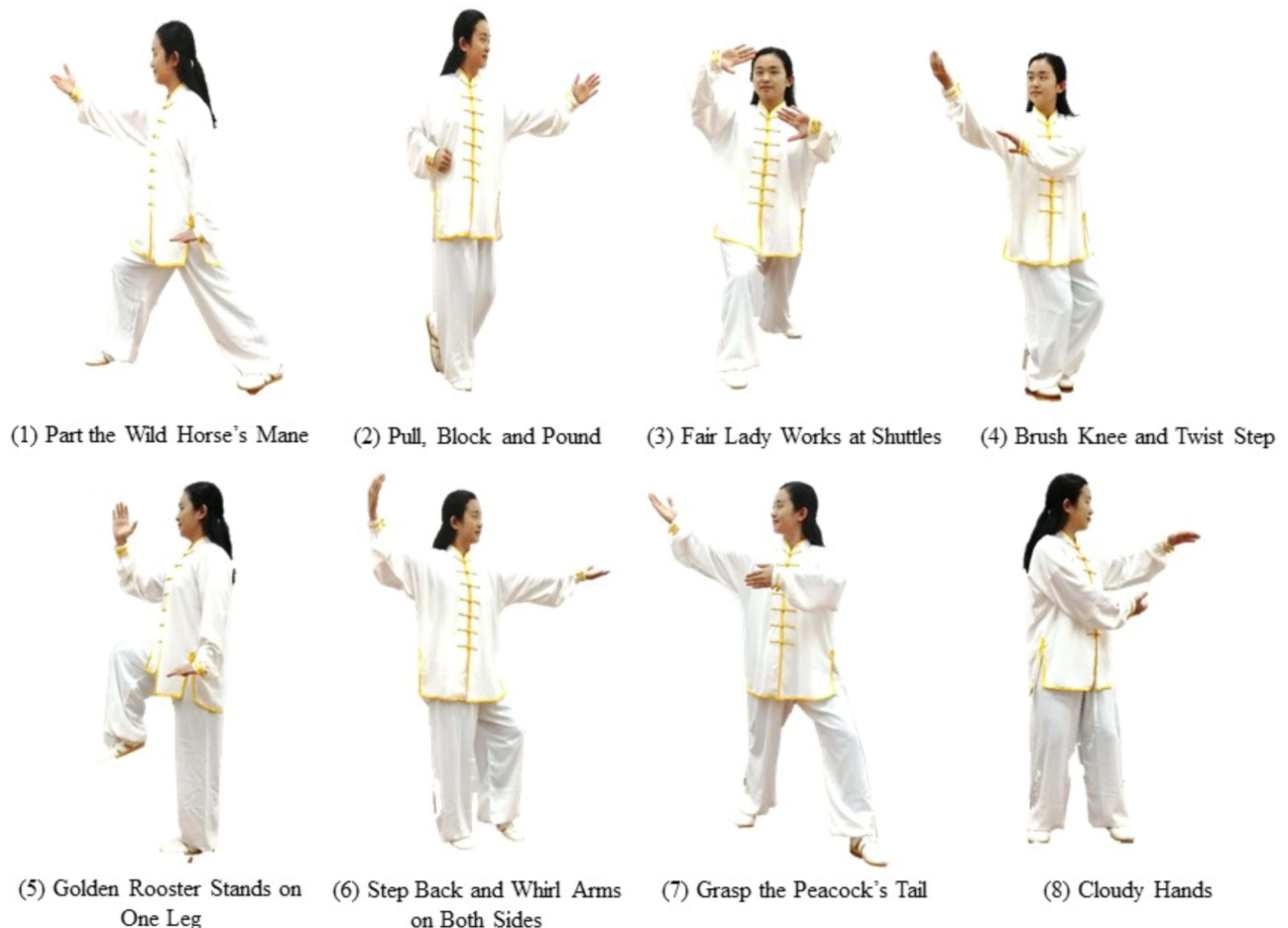
Figure 1 Eight Tai Chi Quan movements.

The movement of TCQ is characterized by moving the limbs with the waist. The intervention program in the Tai Chi group comprises the following movements: (1) Part the Wild Horse's Mane; (2) Pull, Block and Pound; (3) Fair Lady Works at Shuttles; (4) Brush Knee and Twist Step; (5) Golden Rooster Stands on One Leg; (6) Step Back and Whirl Arms on Both Sides; (7) Grasp the Peacock's Tail and (8) Cloudy Hands ( Figure 1 Eight Tai Chi Quan movements). Figure S1 provides the brief description of the eight TCQ movements. The eight movements fully embody this characteristic, with changes in the center of gravity in different directions. Each participant in the Tai Chi group was