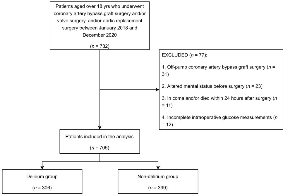
Figure 1 Flow diagram of patients included in the study.

Intergroup comparisons of preoperative and intraoperative glycemic variables are shown in Table 4. The preoperative HbA1c and glucose values at admission did not differ between the two groups. The delirium group had higher intraoperative mean glucose and peak glucose than the non-delirium group (142 [126, 163] vs 130 [119, 146], p < 0.001 , and 186 [155, 219] vs 158 [141, 189], p < 0.001 , respectively). Patients with intraoperative hyperglycemic episodes were more likely to develop POD (38.24% vs 18.55%, p < 0.001 ). When intraoperative glycemic CV was compared as a continuous variable, the delirium group had higher intraoperative glycemic CV than the non-delirium group (22.59 [17.09, 29.68] vs 18.19 [13.00, 23.35], p < 0.001 ), and when intraoperative glycemic CV was classified as quartiles, the incidence of POD increased as intraoperative glycemic CV quartiles increased (first quartile 29.89%; second quartile 36.67%; third quartile 44.63%; and fourth quartile 62.64%, p < 0.001 ).