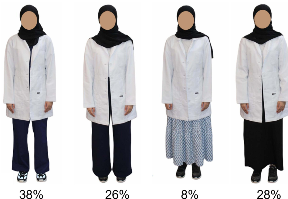
Figure 2 Participants' preferences on female dentist's attire.

Among the tested variables, the majority of the participants rated that recommendation on dentists, treatment cost and clinic location as very important to them when choosing their dentist (see Table 3).