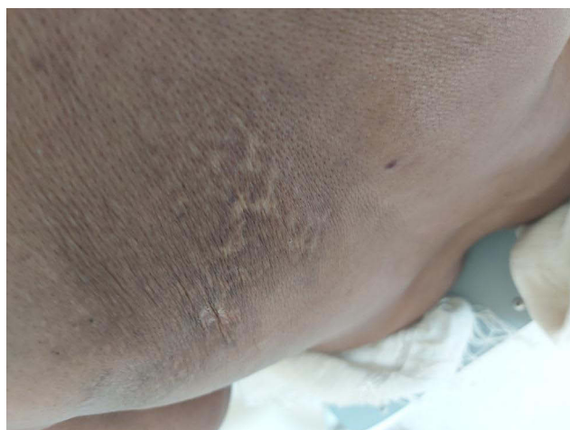
Figure 1 Healed herpetic scar at T4 dermatome.

was normal. She has a healed herpetic scar on the left T4 dermatome (shown in Figure 1).