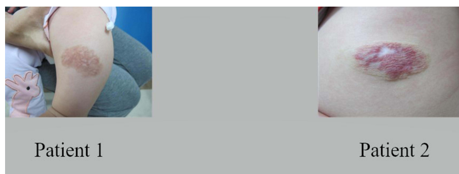
Figure 3 Patient 1 After 5 times of topical treatment with 755-nm long-pulse alexandrite laser combined with 0.5% timolol maleate eye drops, the pigmentation appeared, and the pigmentation subsided within 6 months of follow-up. Patient 2 After 755-nm long-pulse alexandrite laser combined with 0.5% timolol maleate eye drops for topical treatment for 6 times, hypopigmentation appeared and returned to normal within 6 months after the end of the treatment.

but for IHs with a thickness >2 mm, both clinical observations and literature studies show that the final curative effect is unsatisfactory. 19,29,31 According to reports, the penetration depth of a 755-nm long-pulse alexandrite laser is 50-75% deeper than that of PDL. 19 Therefore, the 755-nm long-pulse alexandrite laser has certain advantages over PDL in treating thicker IHs.