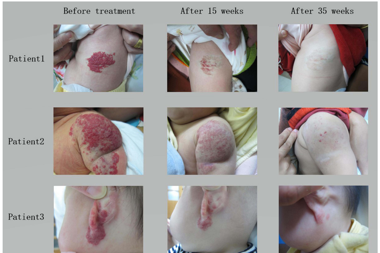
Figure 1 IH treatment with 755-nm long-pulse alexandrite laser combined with 0.5% timolol maleate eye drops. Patients and laser treatment situation: Patient 1: 6 months, male, B-ultrasound: 5mm, 3 times, 3ms, 40 J/cm 2 . Patient 2: 5 months, female, B-ultrasound: 8mm, 6 times, 3ms, 45J/cm 2 . Patient 3: 4 months, male, B-ultrasound: 7mm, 6 times, 3ms, 45J/cm 2 .

cases (6.8%) scab. All the adverse reactions were significantly relieved after 1 to 2 weeks of topical treatment with Fucidic cream, Befuji (topical treatment with recombinant bovine basic fibroblast growth factor) and He-Ne laser. There were no severe complications such as infection and scar. 2 cases (2.7%) developed pigmentation after treatment, and it gradually returned to normal within 6 months of follow-up. We summarize the side effects of 755-nm long-pulse alexandrite laser combined with 0.5% timolol maleate eye drops in the treatment of 74 cases of IH (Table 3 and Figure 3).