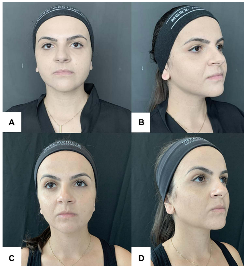
Figure 4 Woman, 36 years old; (A and B) Before procedure; (C and D) 180 days after procedure: discrete slimming of the middle third of the face and marked improvement of jawline 180 days after procedure.

After delimitation, the topical anesthetic was washed off, and an ultrasound gel was applied to the skin immediately before energy delivery. The technology used in all the cases was Ulthera® (Merz Aesthetics®, Frankfurt, Germany) based on the following protocol. First, 4-MHz – 4.5-mm transducers were applied in the first area with 35 homogeneous shots per vertical column and, in area two, with 10 concentrated shots each column.